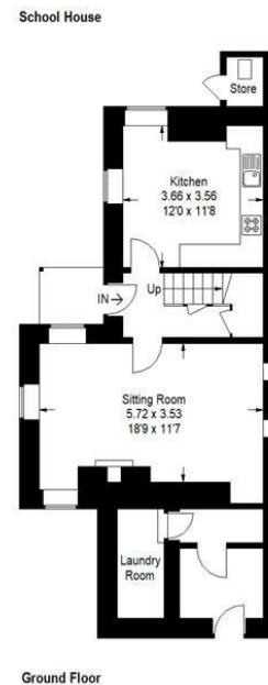
Illustration for identification purposes only, measurements are approximate, not to scale. Fourlabs.co © 2025 (ID1195009)

Approximate Gross Internal Area Bloomers = 106 sq m / 1143 sq ft Lane = 82.2 sq m / 885 sq ft Francis = 76.8 sq m / 827 sq ft School House = 82.8 sq m / 891 sq ft (Excluding Laundry Room / Store) Total = 347.8 sq m / 3746 sq ft