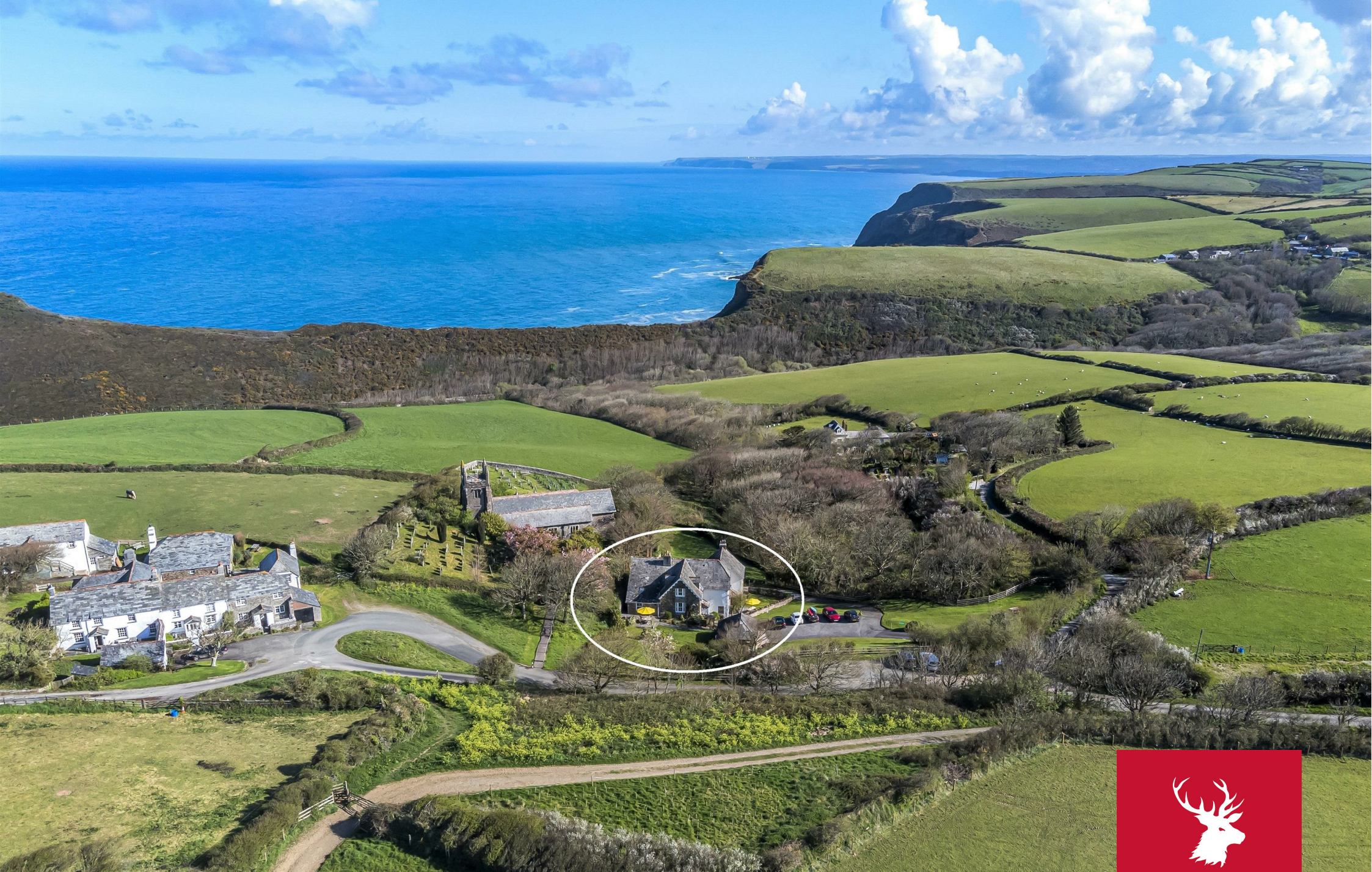
The Old School House